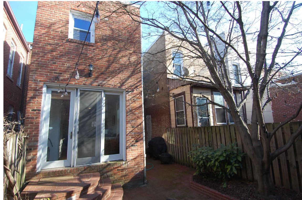
3 Rear Elevation looking Southeast A-3 N.T.S.