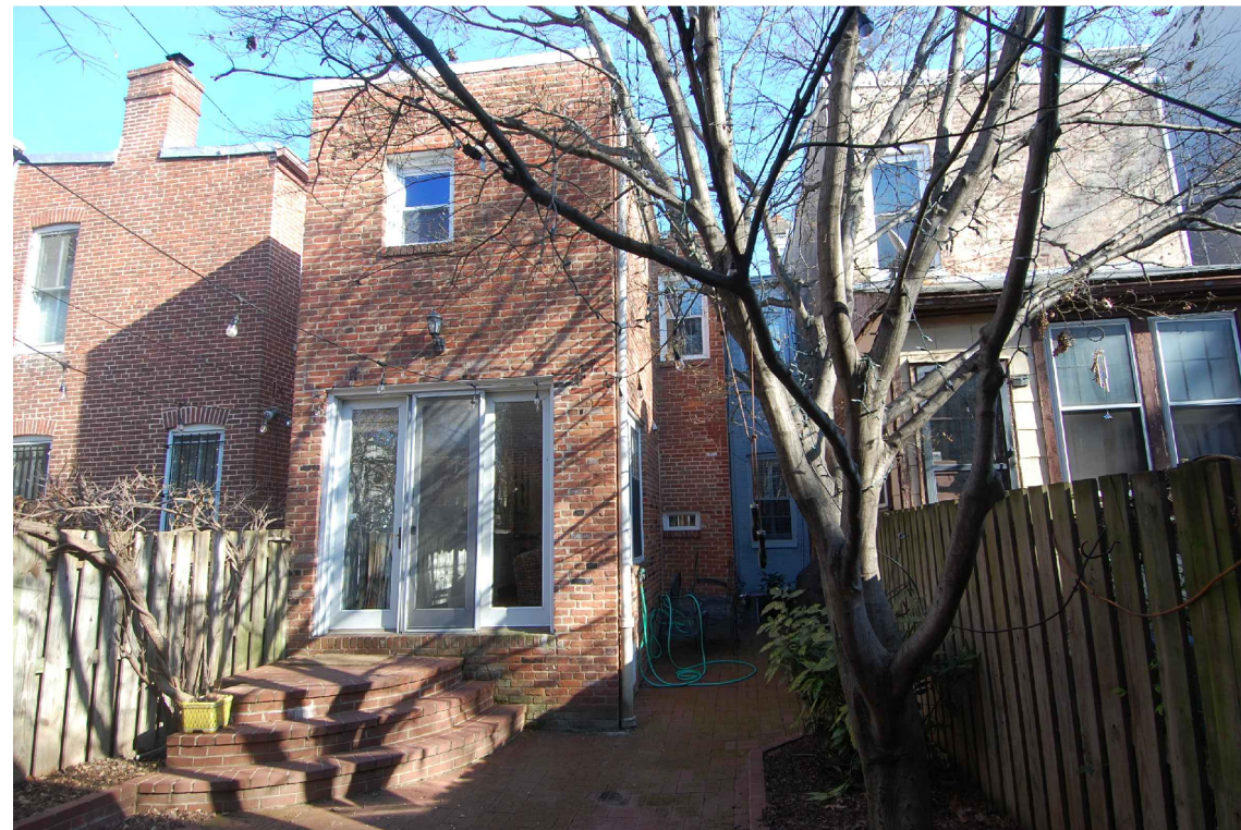
2 Rear Elevation looking East A-3 N.T.S.