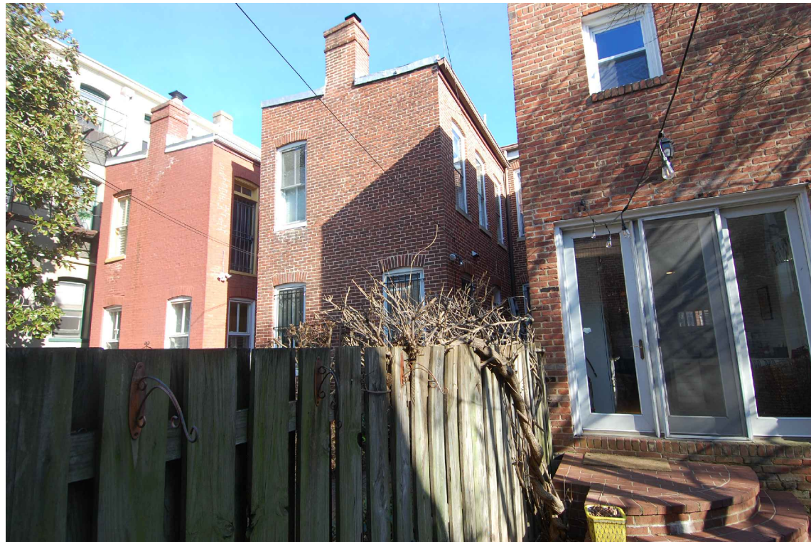
1 Rear Elevation looking Northeast A-3 N.T.S.